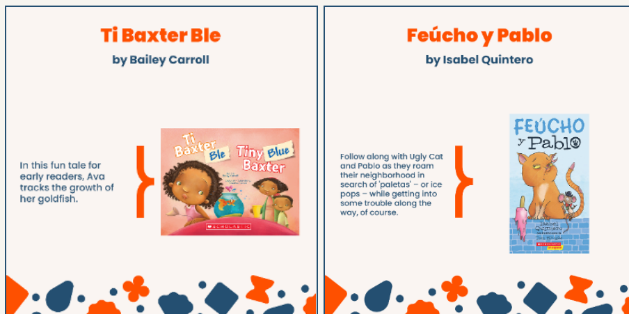
Image preview (only for visual purposes; use link above to download hi-res assets).