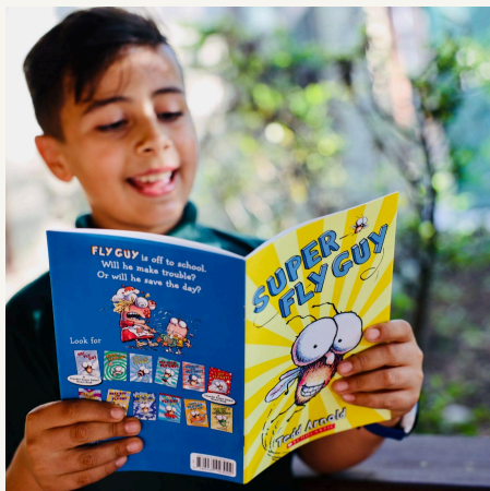
Image preview (only for visual purposes; use link above to download hi-res asset).